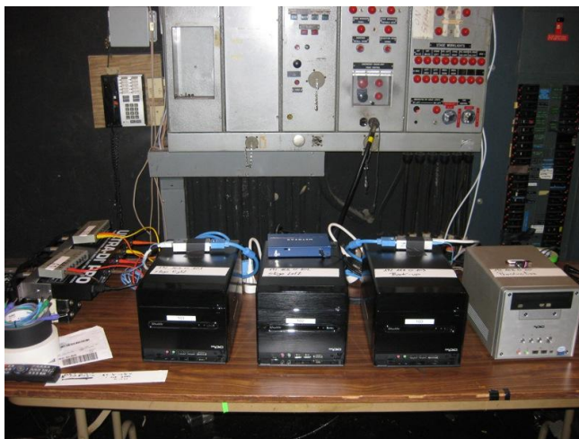
SR or SL (depending on venue) Production Computer Setup 1