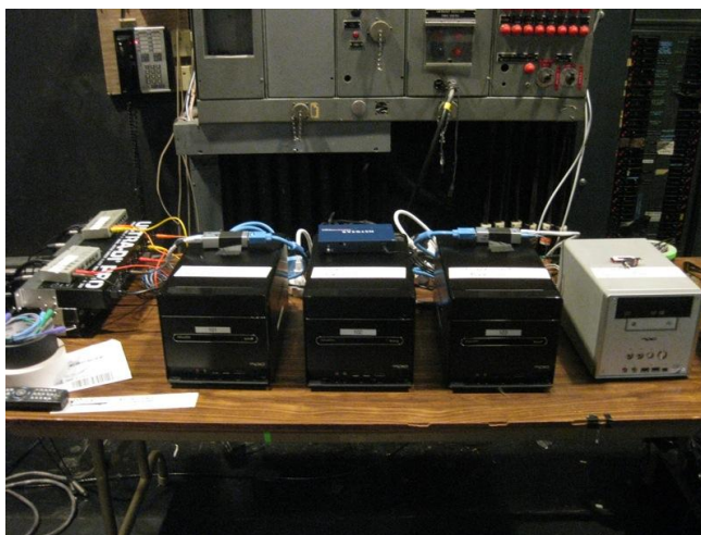
SR or SL (depending on venue) Production Computer Setup 2