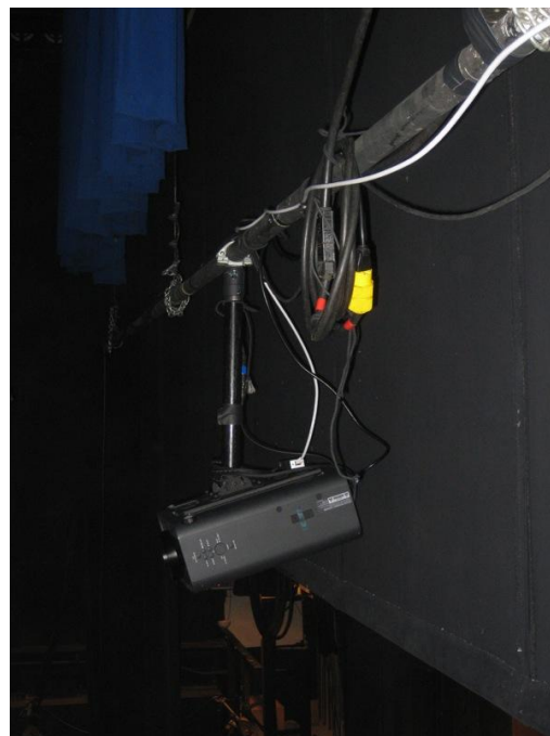
Projector Hanging Rig